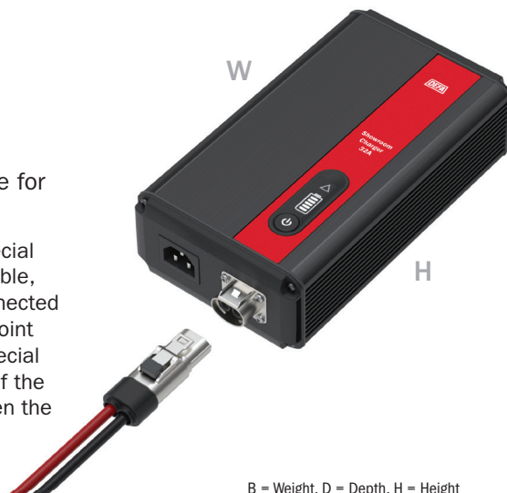
B = Weight, D = Depth, H = Height

It is delivered with a special clamp on the positive-cable, which can easily be connected to the 12V connection point under the hood. This special clamp allows the hood of the vehicle to be closed when the charger is connected.